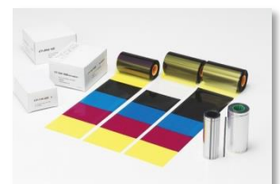
Ink Ribbon & Retransfer Film

*CX-D80 series is prohibited to export/re-export to Cuba, Iran, North Korea, Sudan and Syria by Export Administration Regulations of USA.