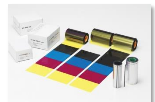
Ink Ribbon & Retransfer Film

*CX-D80 series is prohibited to export/re-export to Cuba, Iran, North Korea, Sudan and Syria by Export Administration Regulations of USA.